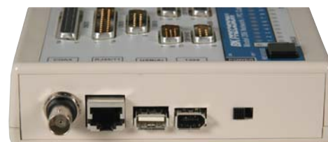
USB A/B & 1394 Fire wire Interface